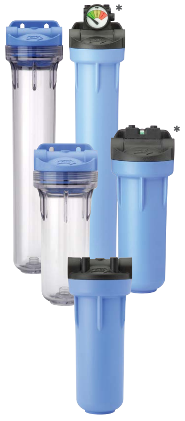
*Shown with differential gauge. Gauges sold separately.

VERSATILE DESIGN ACCEPTS MULTIPLE CARTRIDGE SIZES IN A VARIETY OF APPLICATION SETTINGS